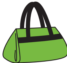
6" X 6" OPAQUE BAG