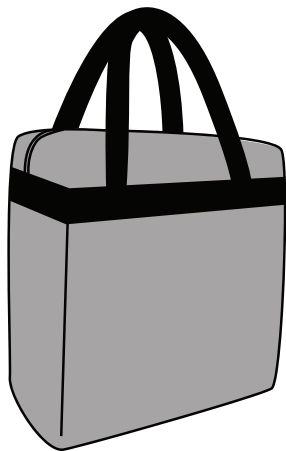
12" X 6" X 12" CLEAR PLASTIC BAG